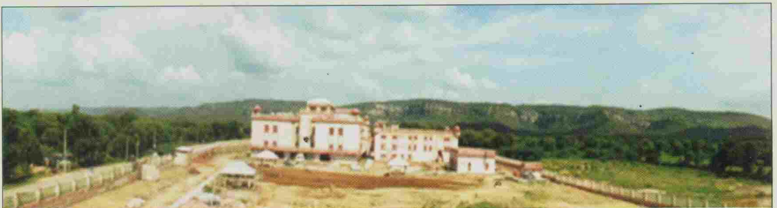
A bird's eye view of the Museum campus

The combination of the RG RMNH along with the Ranthambhore National Park and the cultural heritage hubs such as Shilpgram and Ranthambhore Fort has brought Sawai Madhopur as one of the finest heritage attractions in the country.